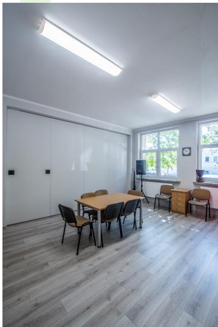
Environmental House of self-help, Białystok

Surface mounted luminaires equipped with highly efficient LED sources. Luminary base made from powder coated steel sheet. Lampshade made from the opal version of methyl polymethacrylate. Luminary mounted directly on ceilings by raw plugs.