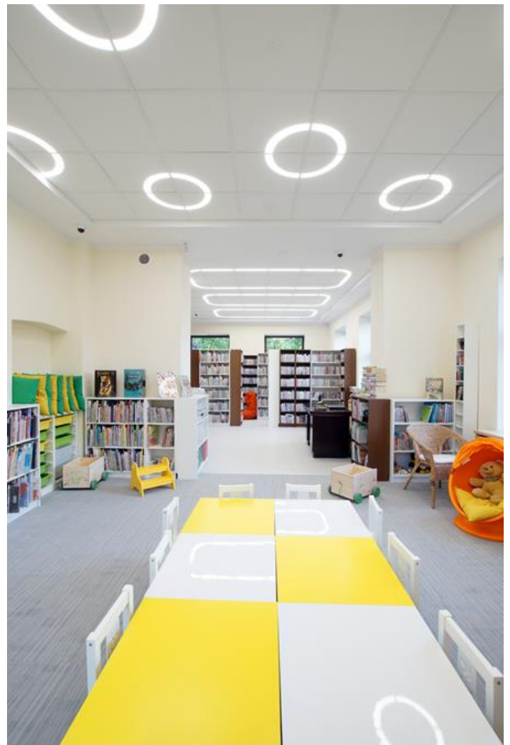
Public Library, Konstancin-Jeziorna

System dedicated for 600 x 600 module suspended ceilings. It has a module and segment construction that includes the simple element, the curve, +-shaped element, L-shaped element and T-shaped element. Combination of these elements provides unlimited possibilities of interior lighting arrangement. It is possible to combine the lighting functionality and unique aesthetics of the interior. The location of segments can be altered any time by turning particular plaster boards. Owing to the color diffusers or LED RGB strips it is possible to obtain some extra color effects. The LED system can be easily dimmed what provides some extra energy savings.