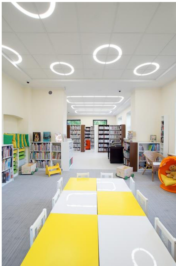
Public Library, Konstancin-Jeziorna

System dedicated for 600 x 600 module suspended ceilings. It has a module and segment construction that includes the simple element, the curve, +-shaped element, L-shaped element and T-shaped element. Combination of these elements provides unlimited possibilities of interior lighting arrangement. It is possible to combine the lighting functionality and unique aesthetics of the interior. The location of segments can be altered any time by turning particular plaster boards. Owing to the color diffusers or LED RGB strips it is possible to obtain some extra color effects. The LED system can be easily dimmed what provides some extra energy savings.