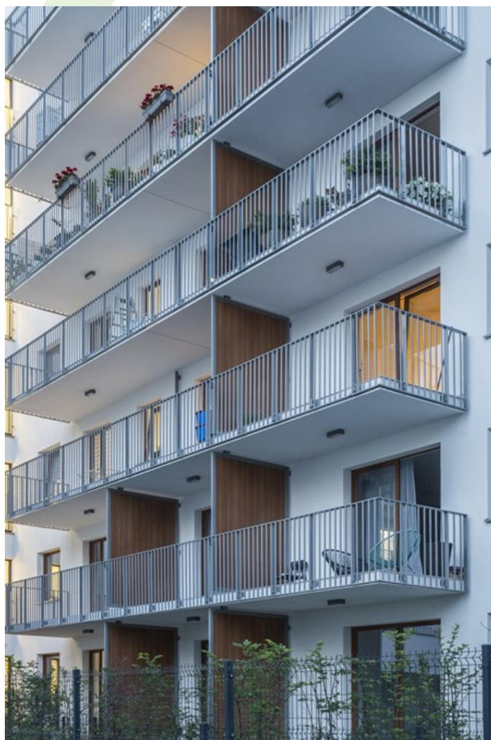
"Awangarda" house, Warsaw

Luminaire for interchangeable light sources so called Retrofit suitable for E27 frame. The body is made of aluminum. PMMA milky colour diffuser. Very easy mounting and access to the interior of the luminaire. Wall mounting (Online Kinkiet) or ceiling mounting (Online Surface).