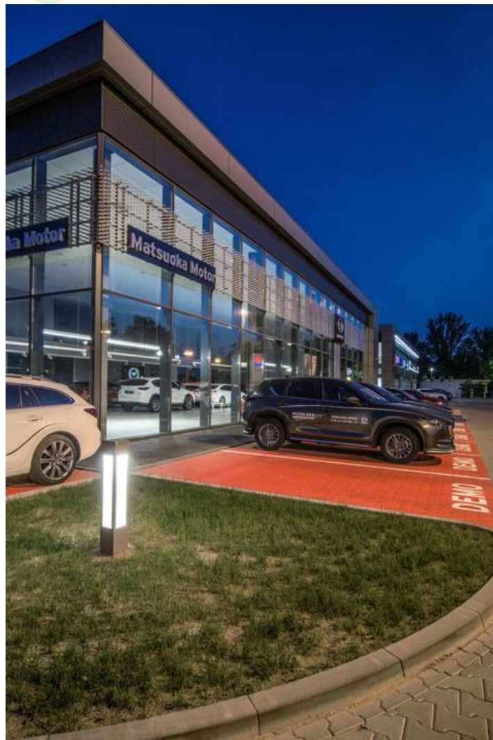
Mazda car showroom, Łódź

Outer luminaire to be mounted on a solid surface (concrete, sett, or substructure) equipped with highly efficient energy saving LED sources of the newest generation. Luminary dedicated to illuminate pedestrians routes such as park alleys, parking site passages, property entrances. Its body made from aluminum which is coated by the facade powder used for outdoor activities. PC opal diffuser. Luminary is hermetic (IP65) – it guarantees no dust or water penetration. It is also shockproof (IK08).