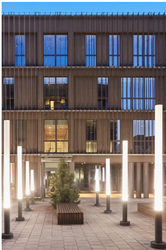
Technology Park, Cracow

Architect luminaires designed for illuminating public green areas such as: parks, squares or lawns. Other important places of applying post lighting fittings is immediate vicinity of public buildings, office buildings and car parks but also green belts along parade lanes, nearness of garden cafes, open spaces in front of cinemas, theatres, hotels and many other places within a urban area. Base made of aluminium, diffuser tube of acrylic satin. Luminaire is equipped with LED panel of high luminous efficacy. The type and dimensions of the foundation each time depend on the foundation conditions. The final selection of the foundation, in accordance with the Building Law, is the responsibility of the designer of the object.