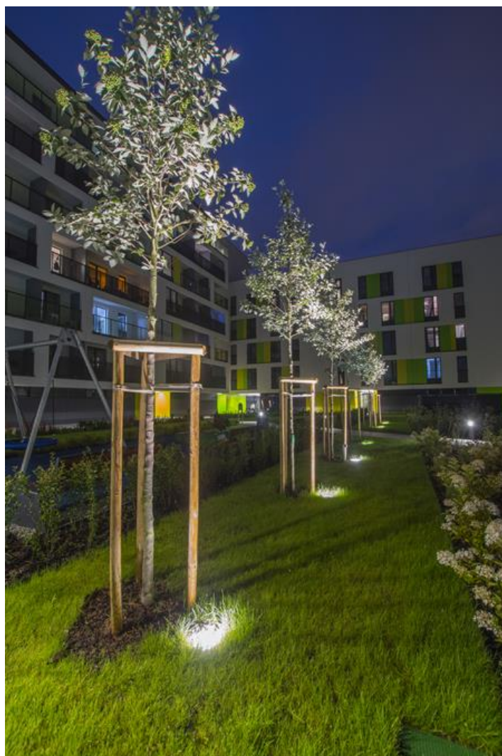
"Artystyczny Żoliborz" residential, Warsaw

Suitable for ground installation. Pressure-injected aluminum die cast housing, corrosion- resisting, hardened glass diffuser of 10 mm thick, INOX stainless steel outer ring. Ring mounting to the housing is performed with the aid of stainless steel screws. Optic composes high level performance anodized aluminum. Silicone gaskets ensure life-span and exploitation. Luminaire delivered with mounting housing included. The luminaire is equipped with a 3 x 1.5 mm 2 power wire with a length of 1.5 m. Resistance to static load 2000 kg. Luminaire recommended for architectural and natural objects.