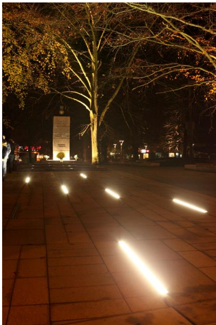
Park in Goleniów

Luminary equipped with highly efficient LED sources. Its body made with aluminum profile that is power coated and resistant to all atmospheric conditions. Optical system consists of high class line lenses made with transparent PC. Diffusor is made from transparent or sand blasted hardened glass assembled in the body of the luminary. Its tightness is provided owing to the higher class silicon seals, all the screws used are from INOX steel. Assembling in ground possible thanks to the mounting box made with aluminum profile included in set. Purpose: illuminating parks and squares, decorative illumination of entrances and paths, as well as surroundings of building structures, small architectural, scientific or natural objects.