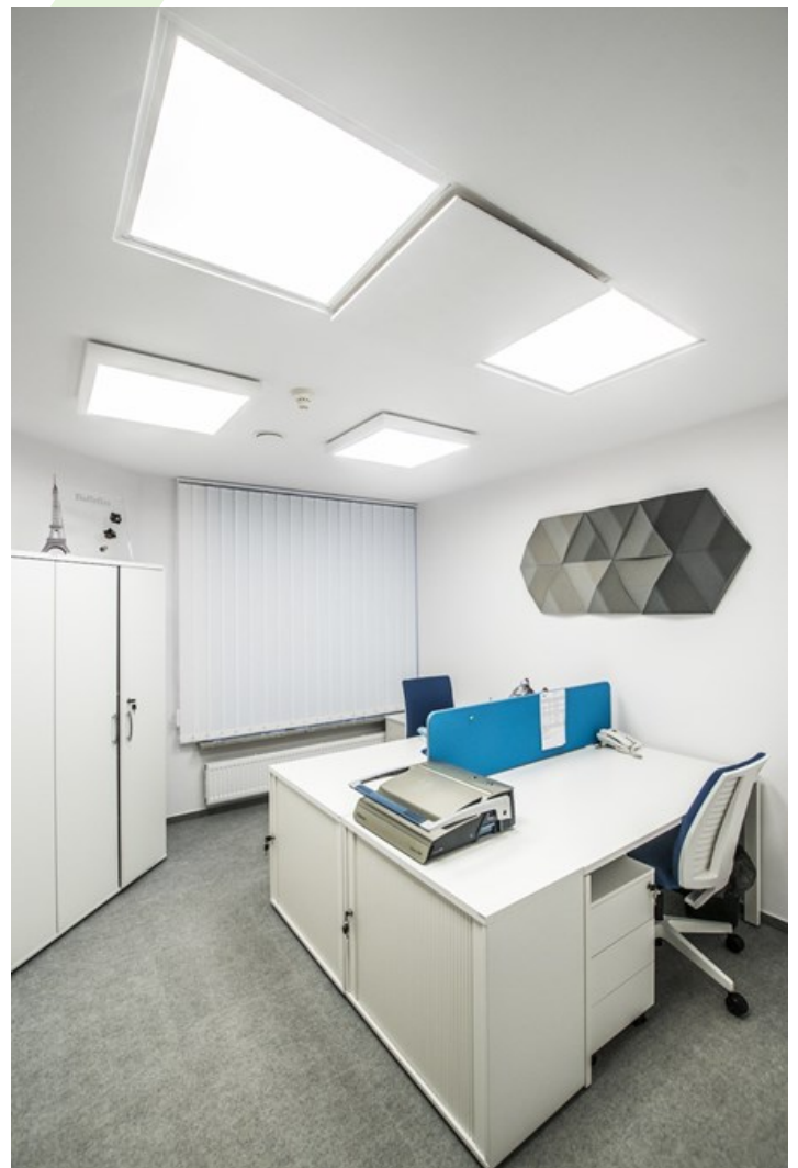
Babyliss PARIS office, Warsaw

Modern LED panel for installation in suspended ceilings or directly on the ceiling. Equipped with the highly efficient LED sources. Luminaire body made from aluminum. PMMA opal diffuser. Colour of luminaire - white. Luminaire dedicated for the public use structure like offices, conference rooms, classrooms, lecture halls etc.