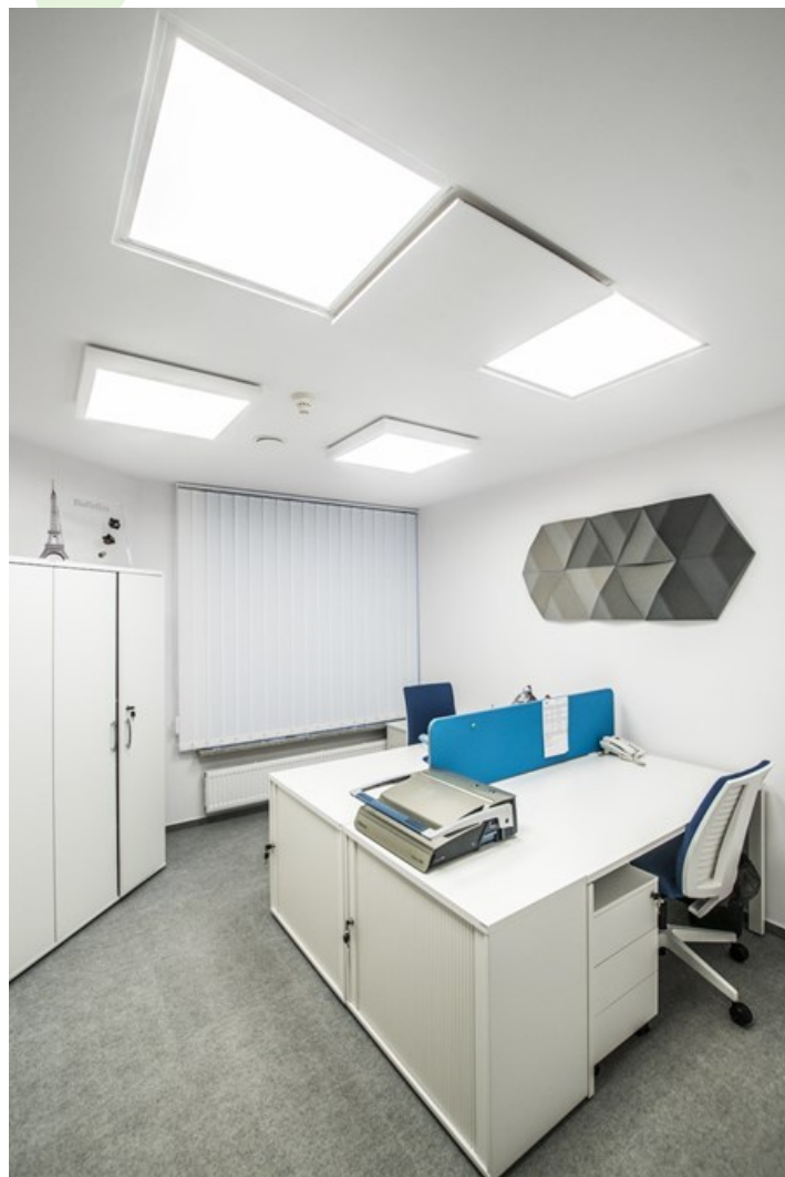
Babyliss PARIS office, Warsaw

Modern LED panel for installation in suspended ceilings or directly on the ceiling. Equipped with the highly efficient LED sources. Luminary body made from aluminum. PMMA opal diffuser. Colour of luminary - white. Luminary dedicated for the public use structure like offices, conference rooms, classrooms, lecture halls etc. The level of protection against solid substances, dust and moisture penetration is IP65.