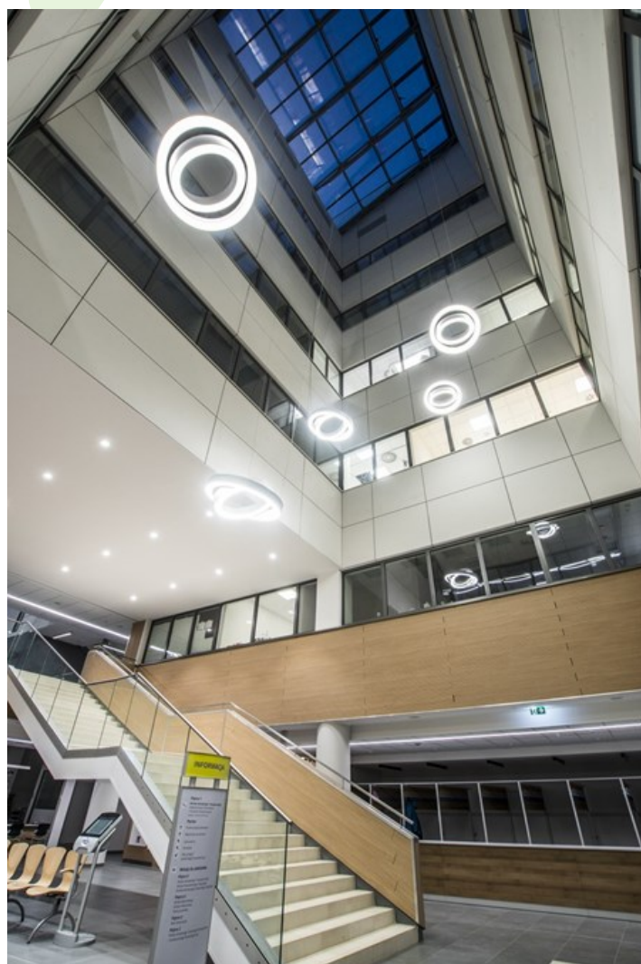
Center of Non-invasive Medicine, Gdańsk

Round suspended luminaire equipped with highly efficient LED sources, designed for interiors with high stylistic requirements. The product consists of two glowing rings that can be adjusted relative to each other. Thanks to this, we obtain a very interesting effect. Dedicated application: representative room facilities such as halls, atria, receptions in shopping malls, museums, offices and many other public facilities.