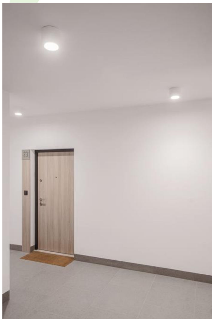
"Metamorfoza Ursus" residential, Warsaw

Downlight surface mounted luminaire made of cast aluminum. Luminaire is dedicated for prestigious interiors such as hotels, banks and offices of higher standard. Owing to the newest components and renowned producers of LEDs applied it was possible to build such luminaires which save energy consumption comparing with traditional solutions.