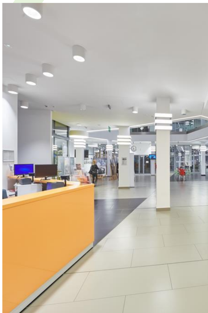
Cultural Center, Kozenice

Surface mounted luminaire of down light type which is built from powder coated steel sheet. IP20 tightness level. Its diffuser optionally can be made from opal PMMA. BERYL LED NO/NK luminaire is perfect to be used in prestige interiors such as hotels, banks, offices, boutiques, and car showrooms.