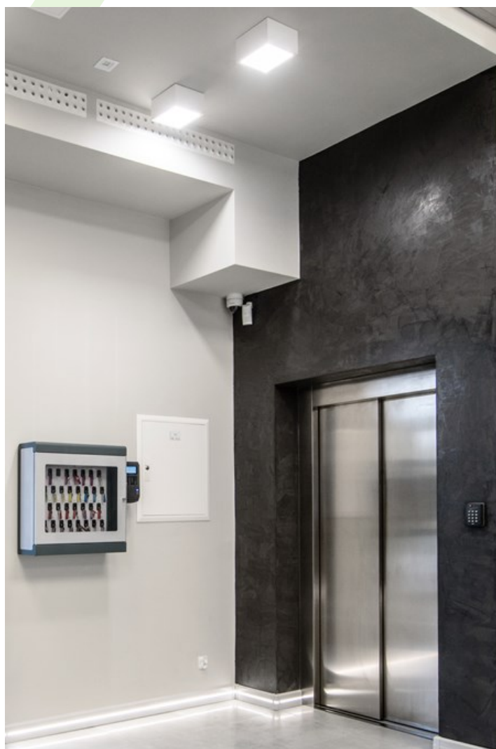
"Stara Łaźnia" art. Gallery, Suwałki

Surface mounted luminary of down light type which is built from powder coated steel sheet. IP20 tightness level. Its diffuser optionally can be made from opal PMMA. BERYL LED NO/NK luminary is perfect to be used in prestige interiors such as hotels, banks, offices, boutiques, and car showrooms.