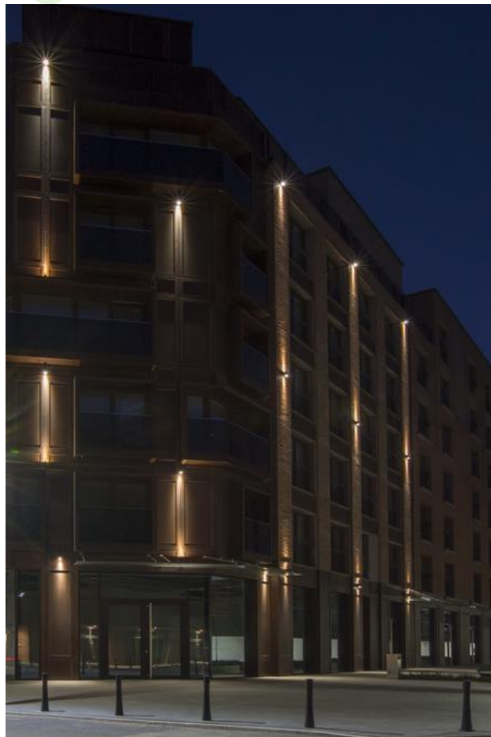
Port Praski - Sierakowskiego 4A residential, Warsaw

Luminary adapted to be mounted on walls. High lighting efficiency LEDs were used as light sources. Optical system consists of professional lens that provide light distribution of 5-21° angle. Owing to the optical system solutions, the product is highly effective. Its body is made from anodized aluminum profile. It is resistant to solids, dust, and liquids penetration – IP40 or IP65. This type of luminary is recommended for decorative or accent illumination, e.g. in restaurants, pubs, or cafes.