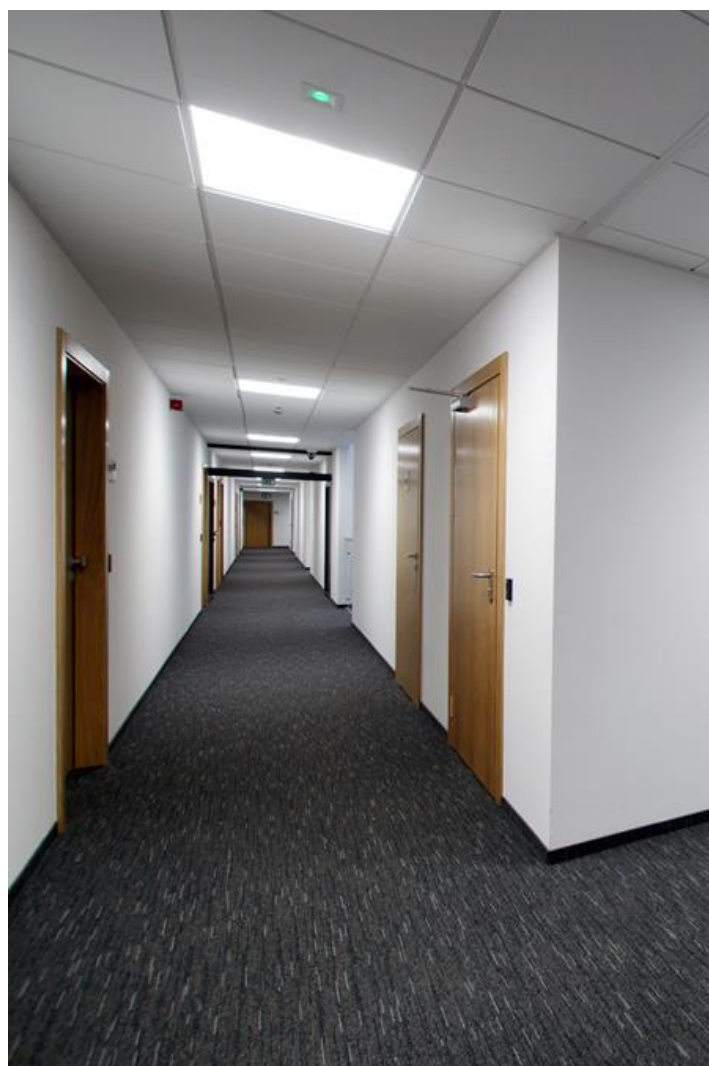
National Research Institute, Warsaw

Luminaire adapted to be mounted on 600 x 600 mm module ceilings. It is equipped with highly efficient LED sources of the newest lighting generation, with the average durability of 60000 h. Diffuser is located in a steel frame which is powder coated in white. The frame is mounted to the luminaire body by the use of springs. There is no need to use any extra tools to mount or dismantle the luminaire. The body is made from steel sheet which is powder coated with mixture of thermostatic synthetic resin, hardeners, and pigments, all resistant to UV radiation. Luminaire resistant to solids, dust, and liquids penetration (IP20/44).