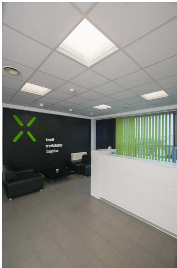
Luxiona Poland office, Warsaw

Housing luminaire for suspended module ceilings. Housing made of steel sheet powder coated in white. Characteristic feature of Agat LED Deco Smooth is 'inserted' diffuser, which after the luminaire is mounted is above the level of ceiling. This solution gives very interesting, original and decorative effect. The luminaire is available with milky colour diffuser PLX or micro-prismatic and is equipped with highly efficient LED light source. Luminous flux of LED light source is 5400 lm. The colour temperature 3000 K or 4000 K. The luminaire is recommended to illuminate public utility facilities.