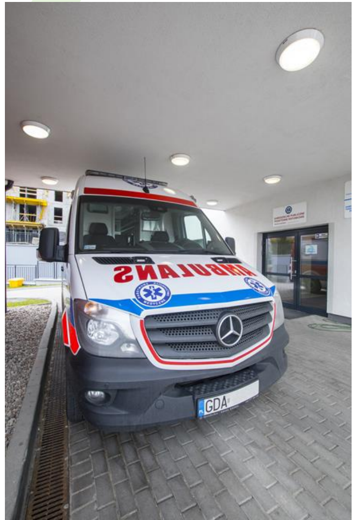
Emergency Medical Services, Pruszcz Gdański

Surface mounted or wall luminaire equipped in highly efficient LED panels. Luminaire body and diffuser made from IK10 impact resistant material. Luminaire recommended for: bathrooms, wards, medical staff room and also in outdoor areas.